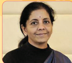
Hon' ble Smt. Nirmala Sitharaman Minister of Finance and Corporate Affairs Government of India